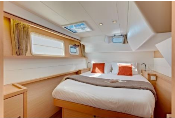
Lagoon 450 - March 2016 - K&L de Lagoon