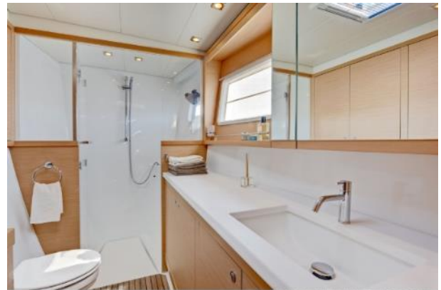
Lagoon 450 - March 2016 - K&L de Lagoon - K&L Yachting credit - Photo: Nicolas Clark