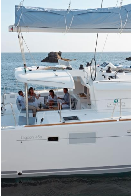
Lagoon 450 - March 2016 - K&L de Lagoon