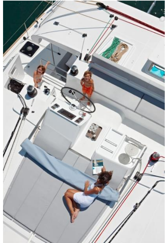
Lagoon 450 - March 2016 - K&L de Lagoon - K&L Yachting credit - Photo: Nicolas Clark

* All pictures are for illustration only.