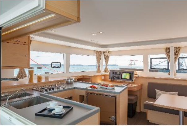
Lagoon 450 - December 2015