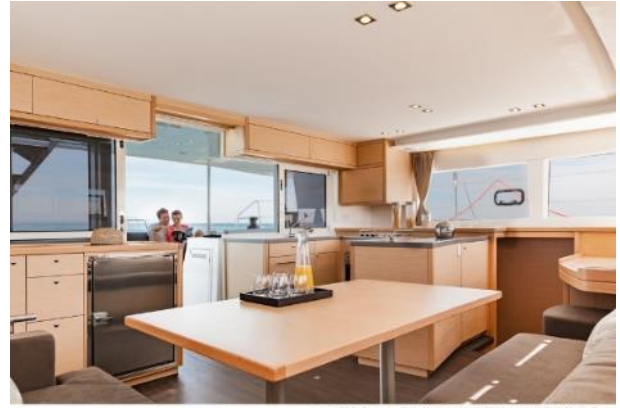
Lagoon 450 - September 2015 - K&L de Lagoon - K&L Yachting credit - Photo: Nicolas Clark